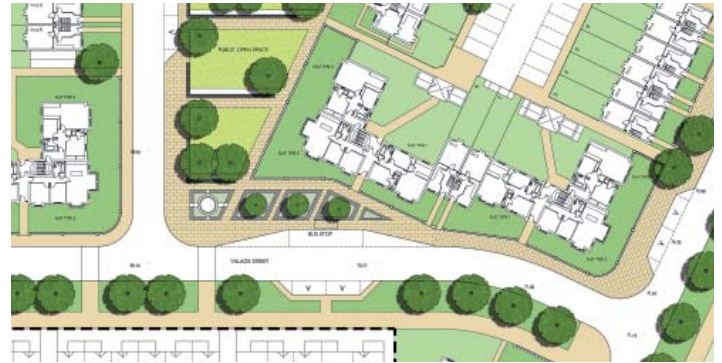
plan of public open space

ark are currently embarking on detail design information to allow work to commence on the bespoke elements of the design which front the spine road.