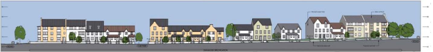
elevation to spine road